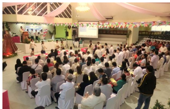
Awarding Ceremony venue attended by various partners of DepEd RO7