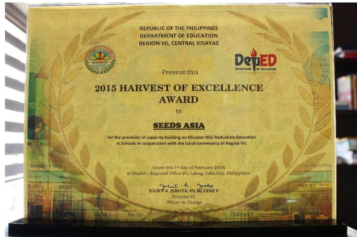
SEEDS Asia Harvest of Excellence Award

SEEDS Asia is very much honored to have been recognized of its valuable contribution to the enhancement of the basic education by providing capacity building on DRR Education to Teachers and integration of DRR Education into their iPlans (Instructional Plans) for Kindergarten to Grade 10 levels as well as having DRR initiatives to be led by schools in cooperation with their respective local communities. This award will serve as an inspiration especially to the SEEDS Asia Cebu Project Team to further work hard for the achievement of the Project Goals of having sustainable DRR Education. Both local and international organizations were likewise awarded with recognition together with SEEDS Asia.